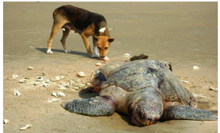
Stray dog feast to a dead female turtle and her eggs