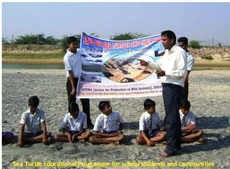
Sea Turtle Educational Programme for school students and communities