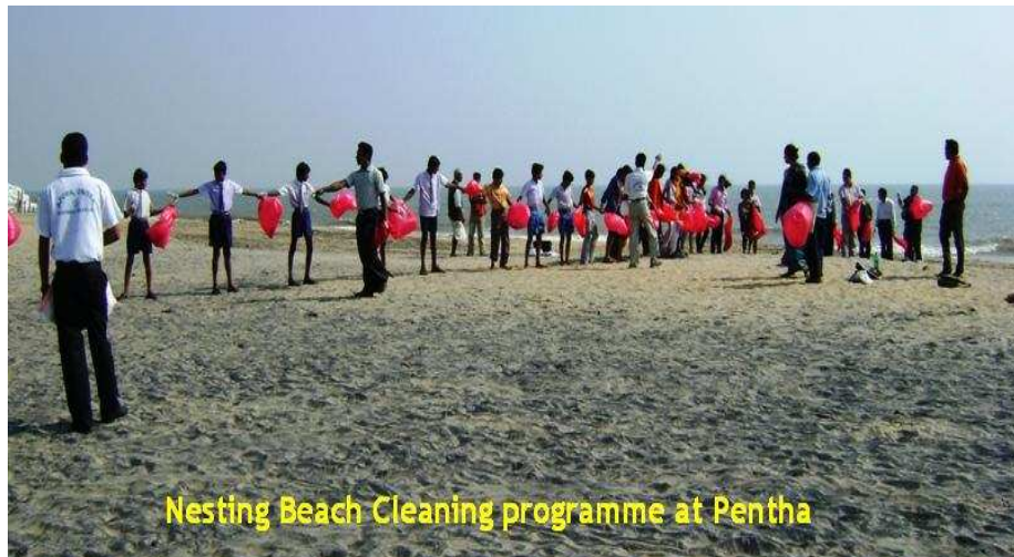
Nesting Beach Cleaning programme at Pentha

The beach debris make the habitat unsuitable for nesting and we are try to clean the beach for providing the Olive Ridley, a safe and clean nesting habitat. The Cleaning of beach debris from important nesting habitat to ensure sea turtles easier access to nesting sites.