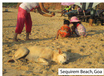
Sequirem Beach, Goa