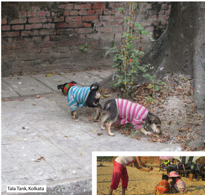
Tala Tank, Kolkata