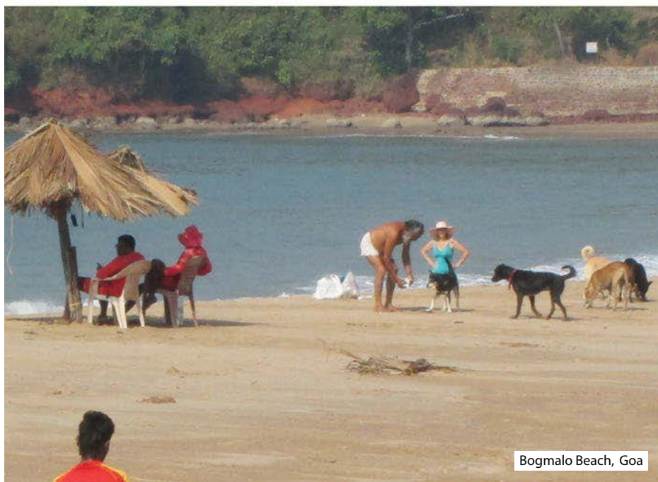
Bogmalo Beach, Goa