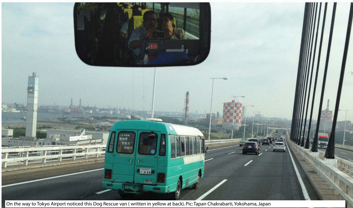
On the way to Tokyo Airport noticed this Dog Rescue van (written in yellow at back). Pic: Tapan Chakrabarti, Yokohama, Japan