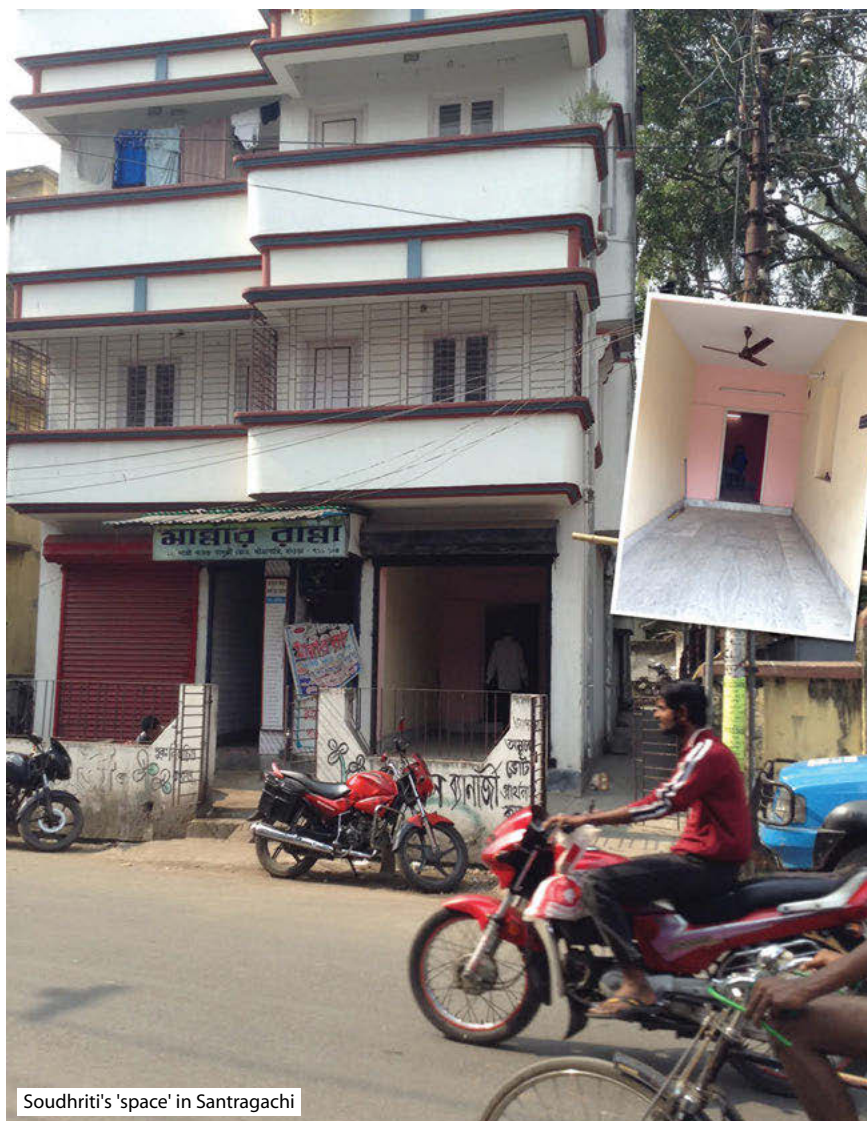
Soudhriti's 'space' in Santragachi