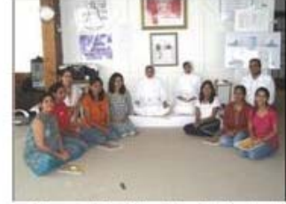
Gyanshala Teacher's Training

Gyanshala teacher's training workshop was held on Aug 17 from 10:00am-3:00pm to train the teachers teaching to JVB Gyanshala students. JVB Gyanshala is a Sunday school program to teach Jain philosophy, Yoga, meditation and moral values to children.