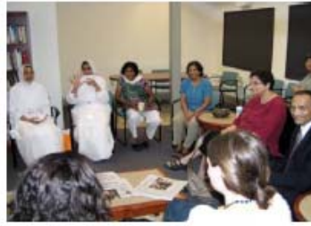
Discussion on Jainism at Yale University