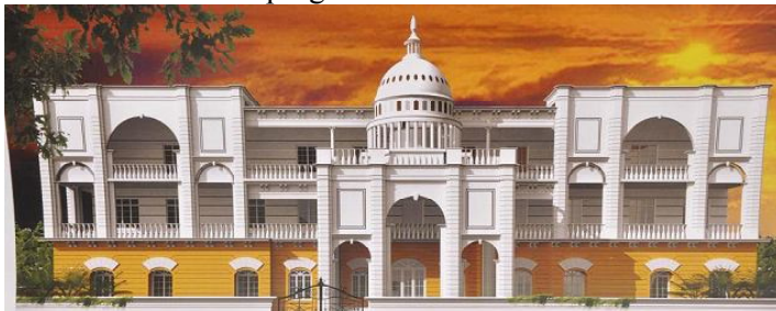
Proposed Building of J.V.I.I.R.T.